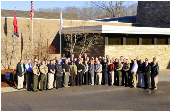
Terrorism Liaison Officers 2012

TLOs raise the level of prevention and preparedness within our communities and better prepare public sector personnel to deal effectively with the threat of terrorism.